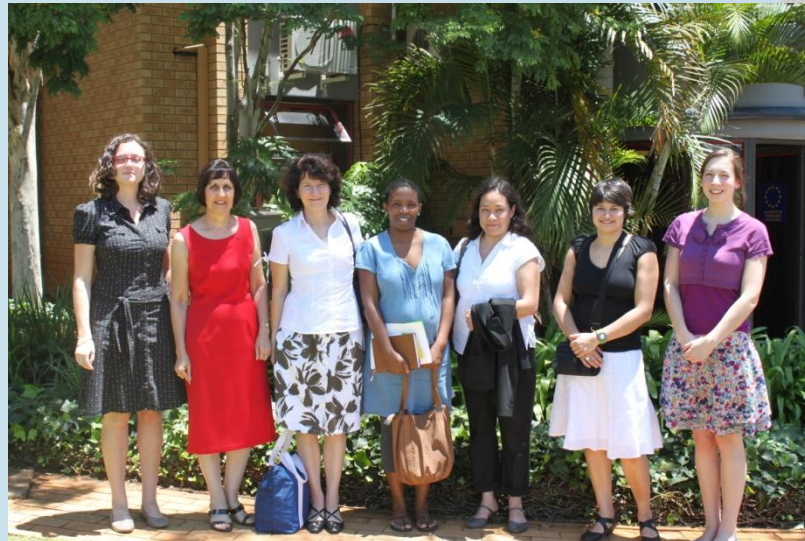
Visit of Leuven coordinators to the European delegation in Pretoria