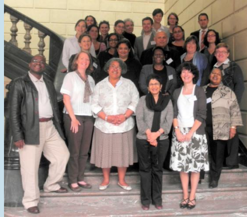
Visit of South African delegation to Leuven (September 2010)