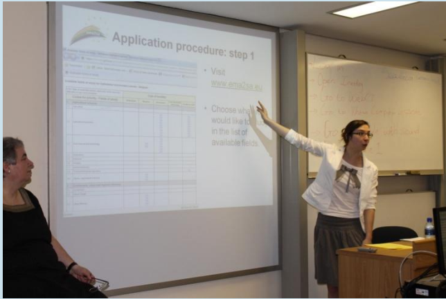
Program Presentation in South African Universities (February 2011)