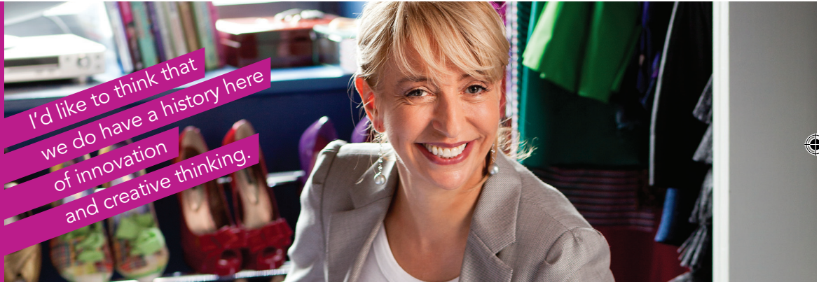
Baroness Susan Greenfield Director of the Institute for the Future of the Mind, Professor of Pharmacology at Oxford University

The Charter & Code set out the rights and obligations of researchers, research institutions and funding providers. Their aim is ensure equitable treatment of all researchers in Europe and to increase transparency in their selection and recruitment. The two documents also address the right to social security coverage and access to pensions.