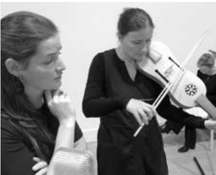
Psallentes © Hendrik Vanden Abeele

Passie van de Stemmen (Voices of Passion), an initiative of the Alamire Foundation and the Leuven cultural centre 30CC, is an annual festival for early music in Leuven featuring international ensembles such as Capilla Flamenca, Cappella Pratensis, ClubMedieval, Encantar, Ensemble Cinquecento, Ensemble Micrologus, Huelgas Ensemble, La Reverdie, and Psallentes. The festival first took place in 2009 in conjunction with the M – Museum Leuven’s inaugural exhibition Rogier van der Weyden 1400-1464: Master of Passions . The following two editions were also organised within the scope of exhibitions: The Anjou Bible. Naples 1340. A Royal Manuscript Revealed (2010); and Divine Sounds. Seven centuries of Gregorian chant manuscripts in Flanders (2011). The fourth festival (2012) was devoted to Reformation(s) , while the fifth will focus on the relationship between the Low Countries and Italy (2014).