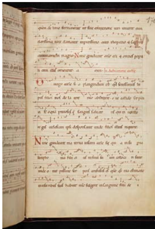
St.-Pieters- & Paulusabdij, Codex Hildegard von Bingen, fol.170r

From the early Middle Ages until the end of the ancien régime, Gregorian chant was omnipresent in European musical life. Despite the fact that Flanders played an important role in the development and circulation of this repertoire, and that a significant number of plainchant manuscripts are preserved, this area of Flanders' musical and artistic heritage is still unknown to many. In 2011 the Alamire Foundation, in collaboration with Illuminare (Centre for the Study of Medieval Art – KU Leuven), presented a selection of these manuscripts, ranging from the eleventh to the eighteenth century. The exhibition Divine Sounds in Leuven's M – Museum demonstrated how music manuscripts changed over the centuries with respect to production, illumination, musical and text notation, and the choice of repertoire. The exhibition focused attention not only on the manuscripts themselves, but also on their contents. Music preserved in four antiphoners on display at the exhibition was performed by international ensembles. An audio-visual installation, called 'Dioramatized #2', offered visitors a way to listen to these recordings and hear the differences in style, form and method of performance.