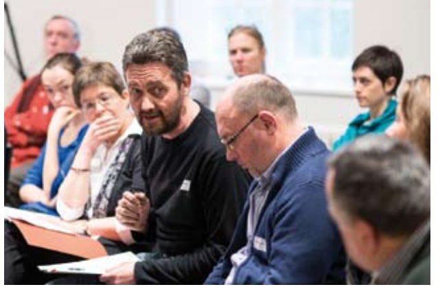
Inspiration Day at the House of Polyphony