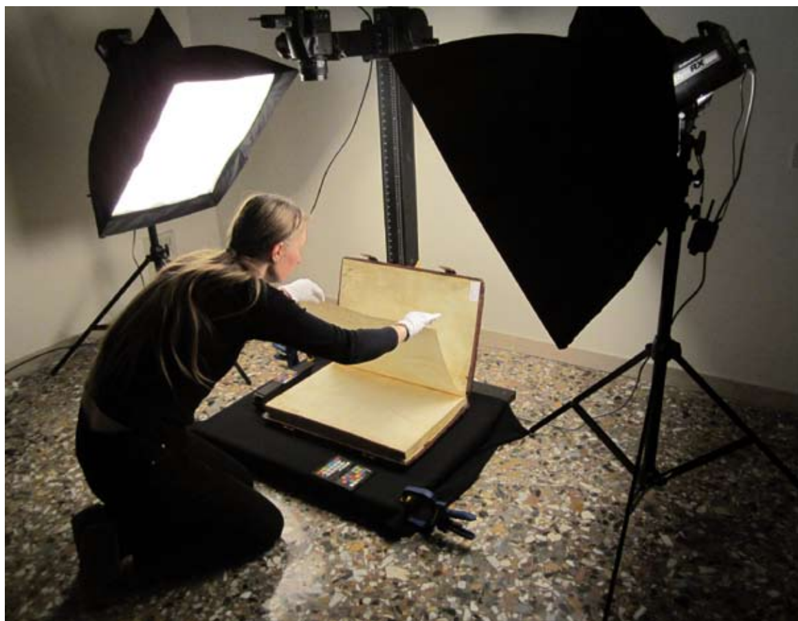
The Alamire Digital Lab at the Biblioteca Apostolica Vaticana

also opens the way to digital restoration of damaged manuscripts. By means of virtual exhibitions and multi-media applications, the digital images also provide access to priceless or fragile – and therefore otherwise inaccessible – sources. Dissemination of cultural heritage to a wide audience through digitisation attests to the cultural relevance of the Alamire Digital Lab. With the development of the ADL, the Alamire Foundation is playing a significant role not only in European musicology, but also in broader cultural and artistic terms.